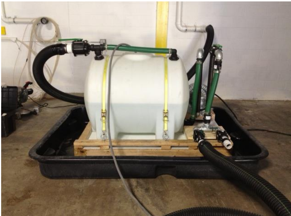
Figure 1 FAST System 250 gallon (950 Liter) scrubbing unit.

has been fumigated. The scrubber functions to capture and destroy any harmful fumigant gas, such as for example methyl bromide or sulfuryl fluoride, which might otherwise be released to the atmosphere after fumigations. The system can be used with pallets, shipping containers, fumigation chambers, trailers and is able to fumigate small buildings and bins from a truck-based mobile system. Methyl bromide (MeBr) or sulfuryl fluoride (SF) is drawn out of the area fumigated by a regenerative air blower that forces contact with the scrubbing liquid through a multi-prong filter head. The spent fumigant gas is agitated through the solution causing a chemical breakdown of the fumigant gas into liquid and other non-hazardous by-products.